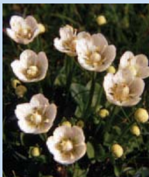
Grass of Parnassus

Out to sea, look for dolphins, porpoises and whales which pass this way especially in early autumn. Loch of the Stack is a shallow loch